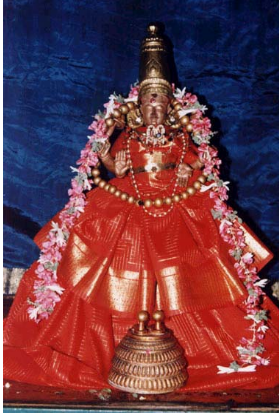
Thuppul Sri Maragathavalli Thayar

The First sLOkam of Sri Sthuthi is recited for the copious flow (PathinettAm Perukku PravaHam) of MangaLam coming our way (Home, Community, Nation):