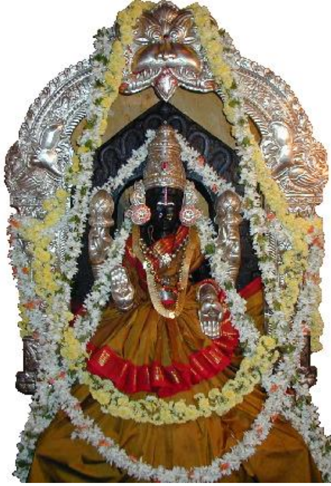
Senchulakshmi Thayar Moolavar – Ahobilam

उद्देश्यत्वं जननि भजतोरुज्झितोपाधि गन्धं प्रत्यग्रूपे हविषि युवयोर् एक शेषित्व योगात् । पद्मे पत्युस् तव च निगमैर् नित्यमन् विष्यमाणो नावच्छेदं भजति महिमा नर्तयन् मानसं नः ॥ ६ ॥