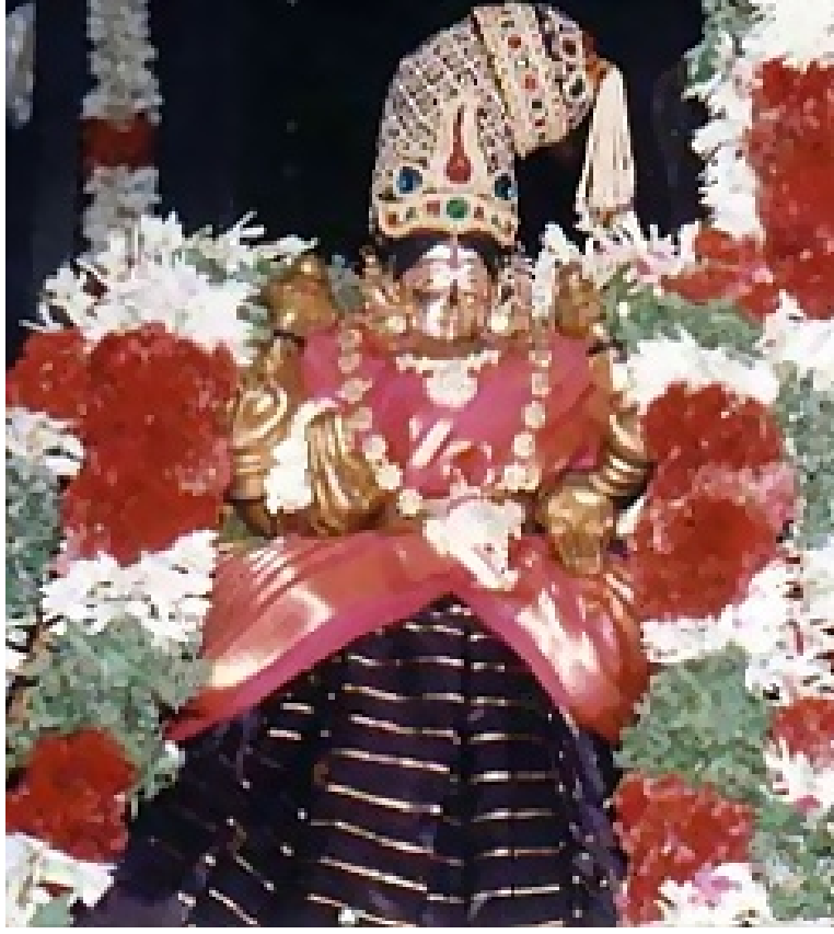
ThirukkUDal Madhuravalli thAyAr

The 24th sLOkam (DhyAna sLokam) is recited for gaining all types of desired Phalans from Sri Devi: