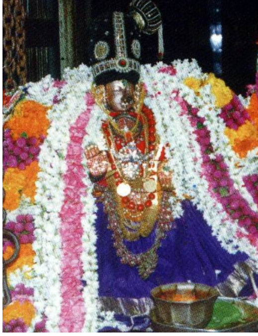
Seerkazhi maTTavizhkuzhali thAyAr

The 16th sLOkam is recited for the growth of one's wealth.