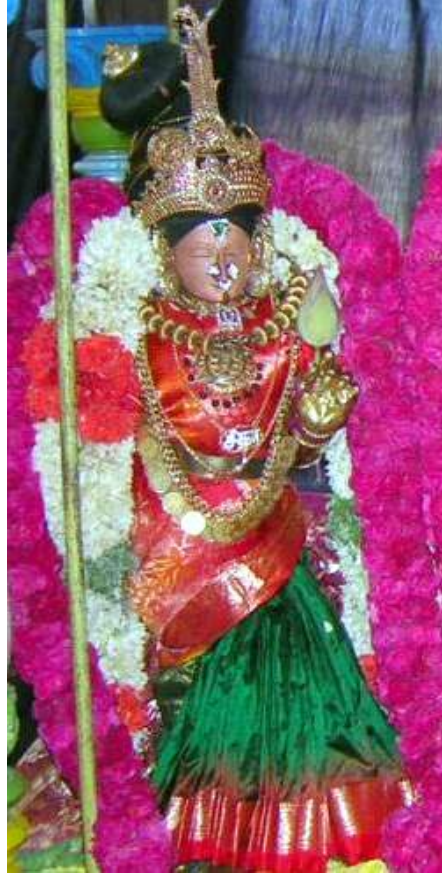
Vaduvur SithAdEvi thAyAr