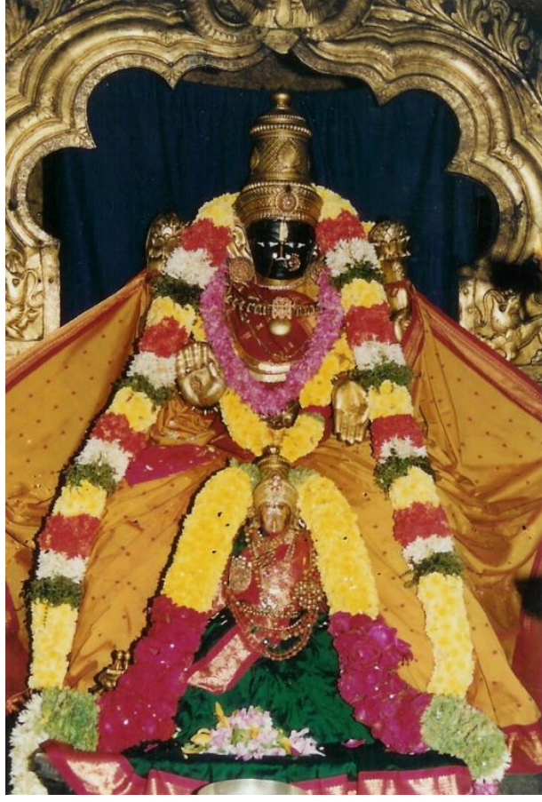
Yadhugiri nAchchiyAr- mElkOTe

The 22nd slokam is recited for removal of fear from Samsaram and growth of Bhagavath Bhakthi: