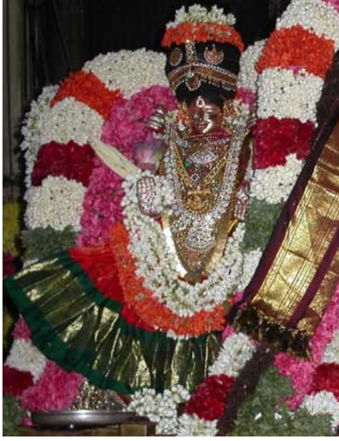
Thiru-ayindai hEmAbjavalli thAyAr

This 12th slokam is recited to gain the highest of the VidhyAs (AdhyAthma Vidhya):