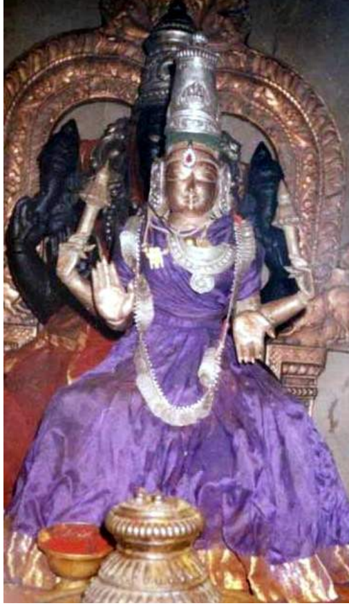
ThiruppErnagar kamalAdEvi thAyAr

The 18th sLOkam is recited for control over one's roaming Mind (sanchala Manas) for gaining the Moksha sukhham: