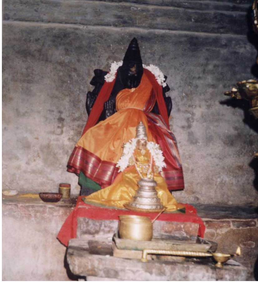
Thiru AadhanUr ThAyAr

This slokam is recited to gain EmperumAn's anugraham: