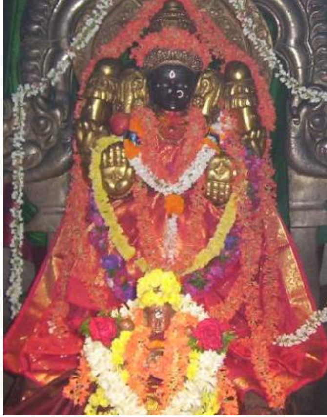
Madhyarangam RanganAyaki thAyAr