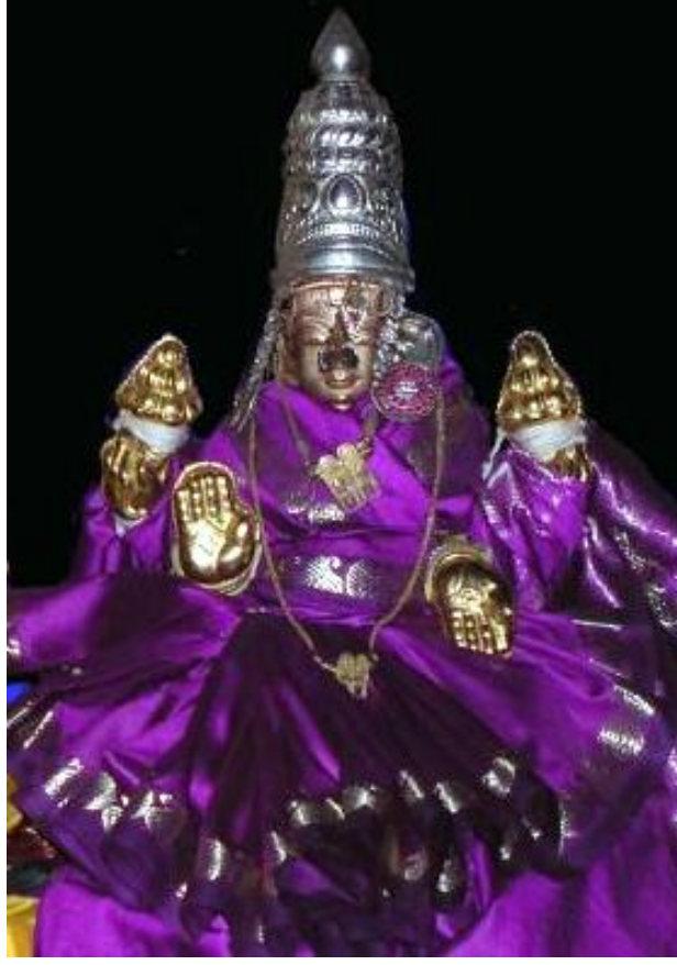
Ahobilam Senchulakshmi thAyAr

The 25th sIOkam is the Phala Sruthi sIOkam for Sri Sthuthi: