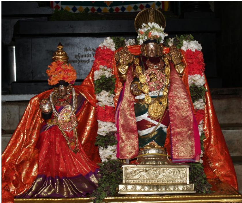
Thayar with urchava Perumal – Thiruvinnagaram