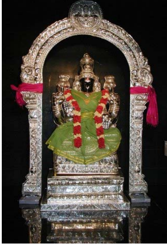
Sri Ranganayaki Thayar – Pomona, USA

This SLOkam is recited for the growth in VedAnthA VidhyA since She sports on top of VedAntham (Moulayasccha SrutheenAm sayyA VisEshA: sampadhyanthE).