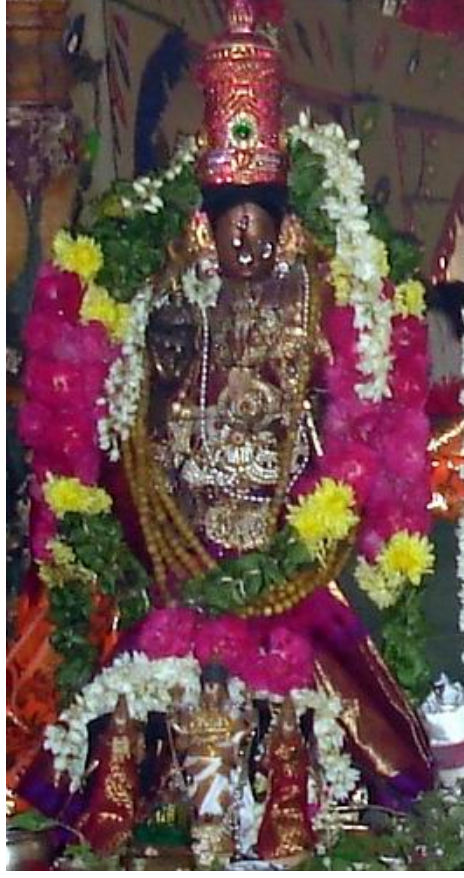
ThirunaRaiyUr VanjuLavalli thAyAr

The 20th slokam is recited for being blessed with Moksha Sukham: