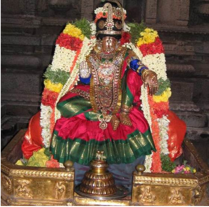
Sri Vedavalli Thayar - Thiruvallikkeni

This slokam is recited to gain Keerthi in this world & to thrive.