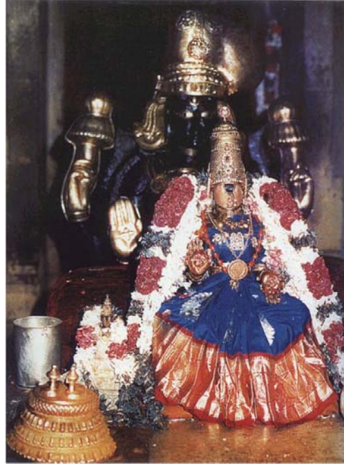
Sri Ranganayaki Thayar - Srirangam

As AdhikAra ArchA Moorthy, She stays at Her separate Temple (Sannidhi) without Her Lord.