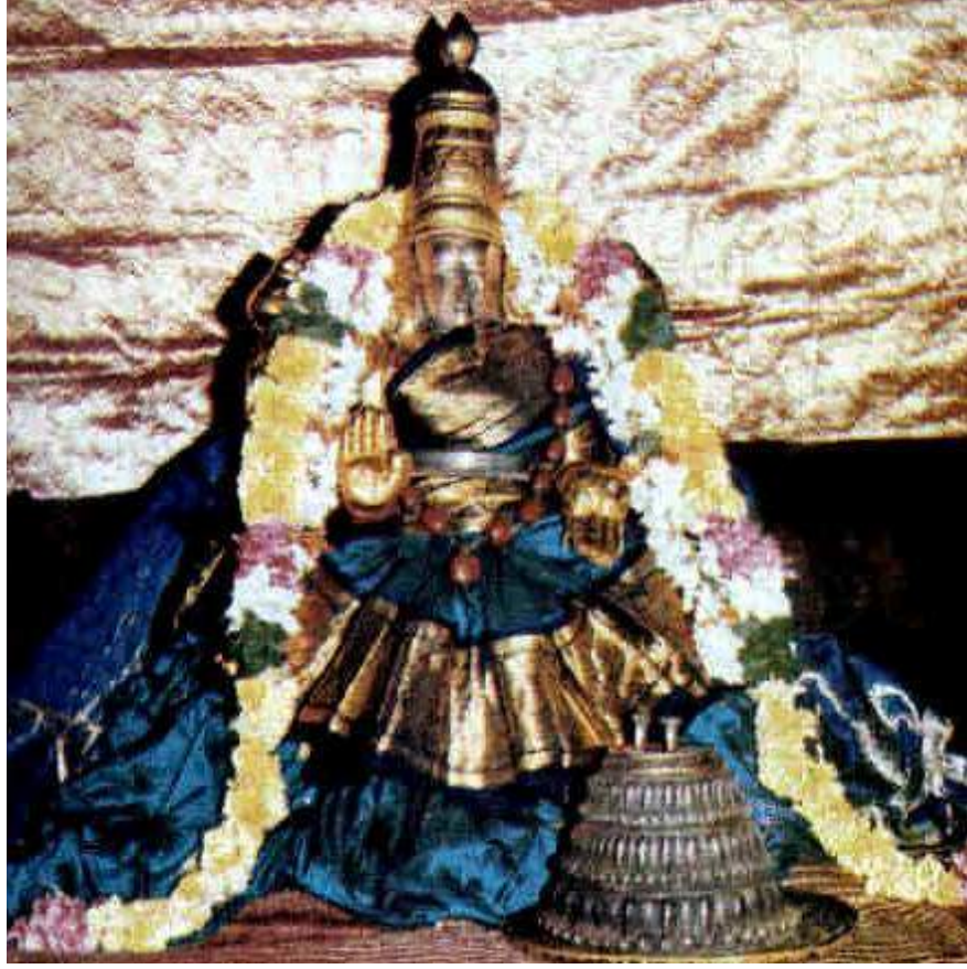
Thirupputkuzhi maragathavalli thAyAr