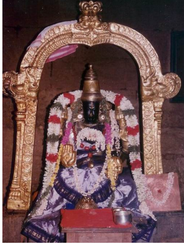
Perundevi Thayar - Moolavar

This slokam is recited to drive away one's accumulated Sins: