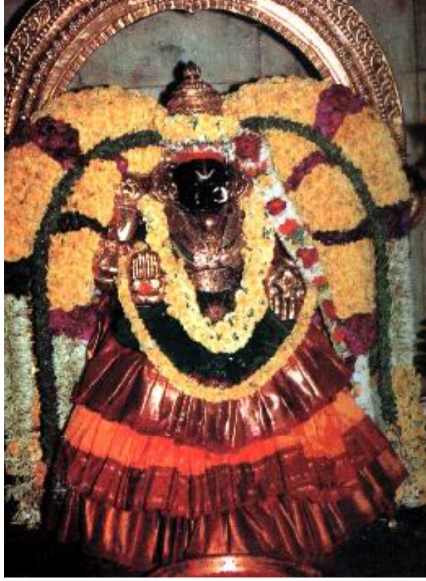
Padmavathi Thayar – Thiruchchanur