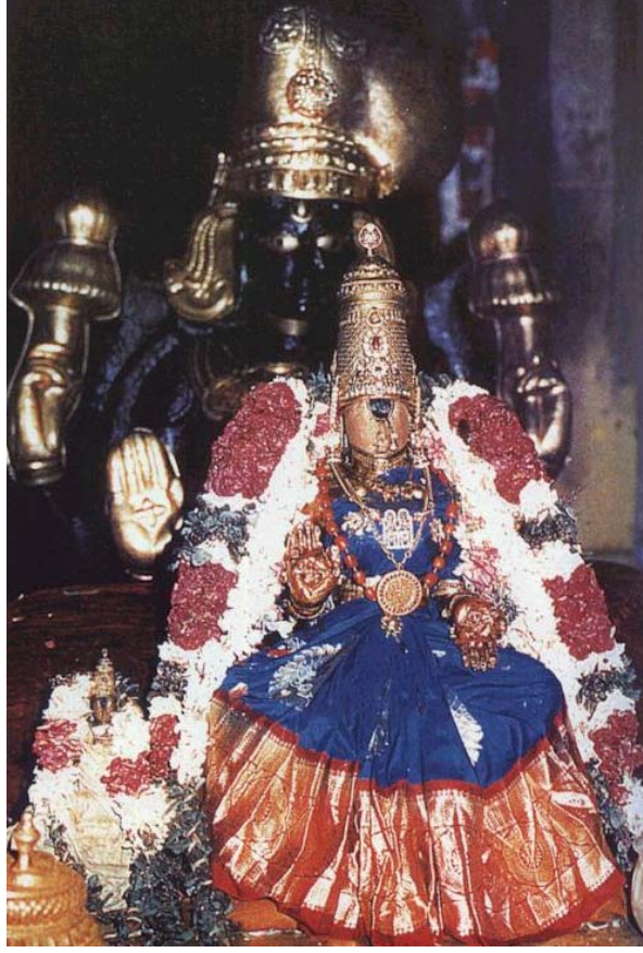
SrIranganAyaki thAyAr – Srirangam

The 14th sLOkam is recited to remove the curses (Saapams) incurred due to apachArams to BhagavathAs: