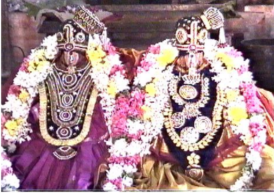
KuzhaikkAdhuvalli & ThiruppErai nAchchiyAr

The 17th sLOkam is recited for attaining high positions in one's life: