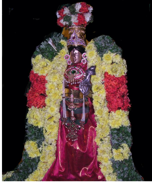
Sri Potramaraiyal – Pullambhudangudi

In the Fourth Slokam, Swamy Desikan describes how Sri Devi reveals Her Lord as Para Devathai to us.