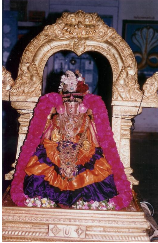
Thayar – Kanchi Perumal koil

The Second sLOkam of Sri Sthuthi is recited for the abundant flow of dhiyya Vaak blessed by VaaNi, the beloved Devi of Lord HayagrIvan: