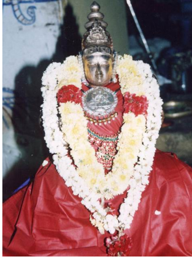
Thayar – Thanjai Mamanikkoil

This slokam is recited to get freedom from SamsAric Sorrows :